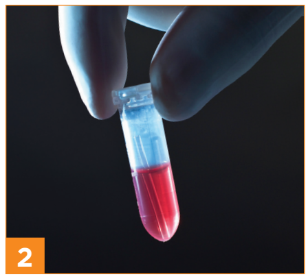
Place capillary into cup and invert until mixed.

Collect 20 \mu l blood sample in capillary.