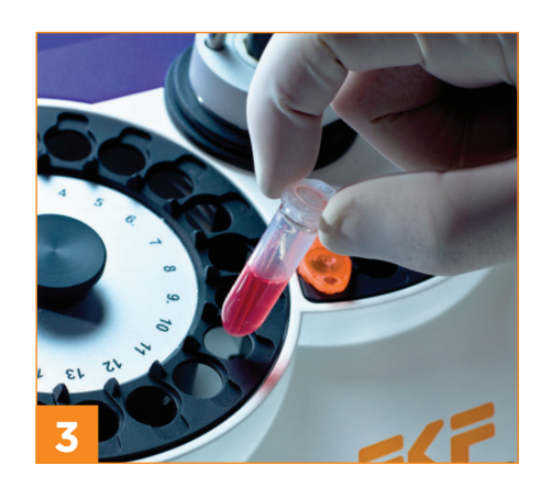
Result in 20-45 seconds.